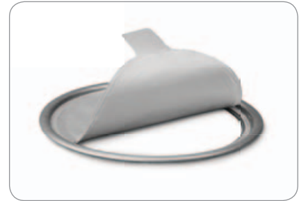
Alufix® Retort end