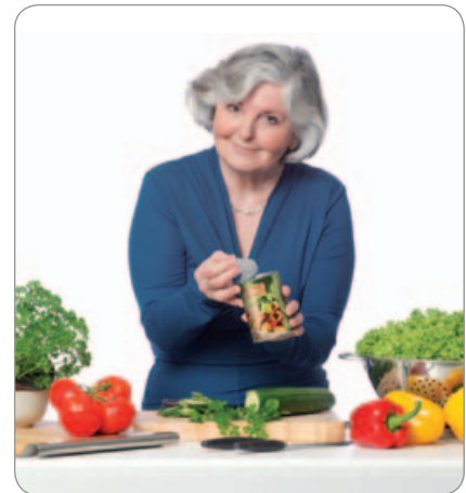
Alufix® makes opening cans easy and safe.