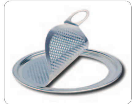
Alufix® Dry end