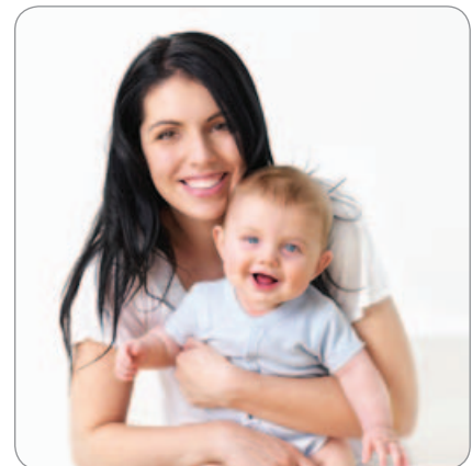
Our BPA and melamine free Alufix® Dry offers a great alternative to package baby food.